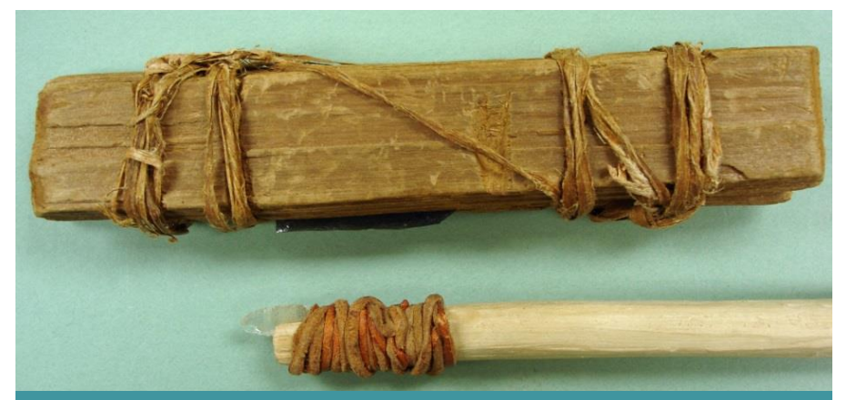
Above: Examples of how microblades were put in handles. Below: Microblade cores of Quartz Crystal (left) and Dacite (right).

Pressure flaking was an efficient and sustainable use of limited raw materials and because of their small size they were easy to trade over long distances.