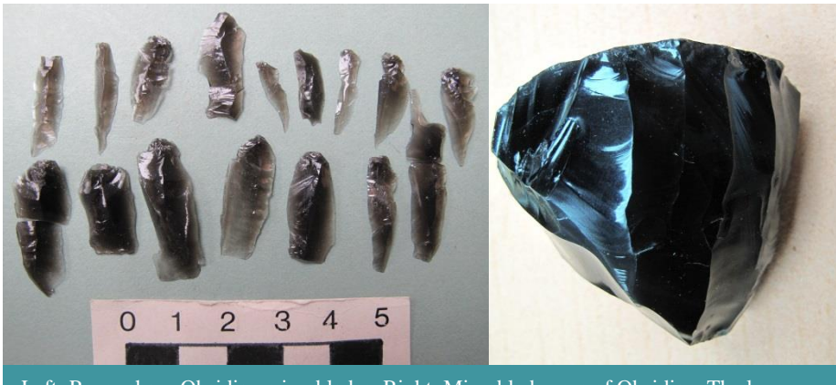
Left: Razor sharp Obsidian microblades. Right: Microblade core of Obsidian. The long flutes show where the sharp blades came from.

The evidence for microblade technology is found in the form of tiny thin blades and the small wedge or conical shaped cores from which they were removed.