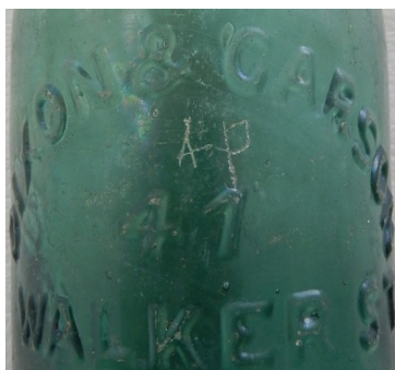
Close-up showing scratched initials "AP"

How did an 1850s to 1860s soda bottle from New York City end up in gold rush era Victoria? How was it associated with a prominent citizen and community leader who made his fortune in Victoria?