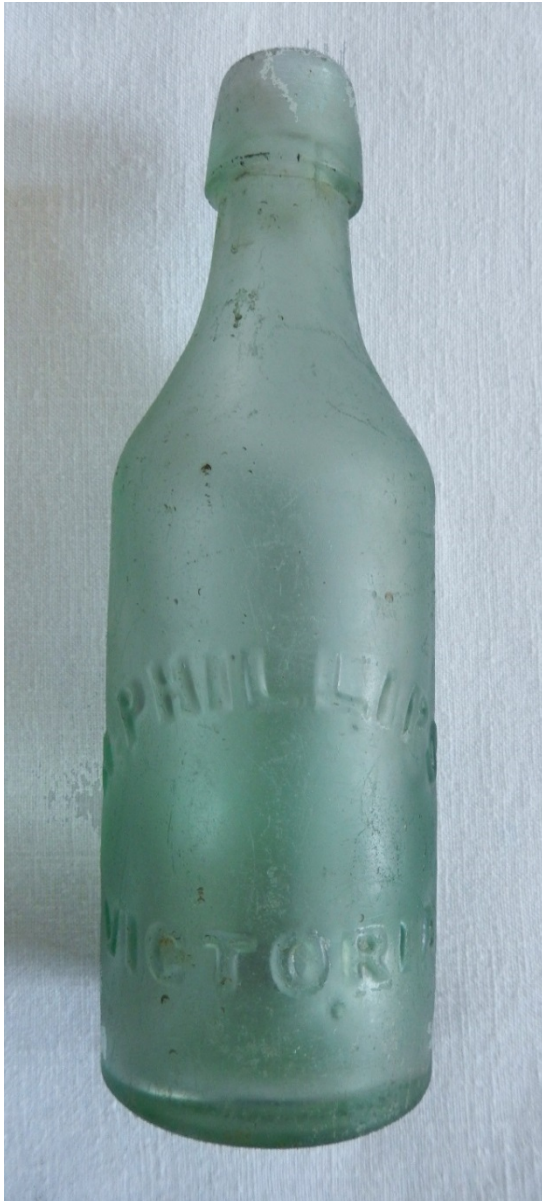
These bottles were recovered from the Victoria Gorge, and are in a private collection.