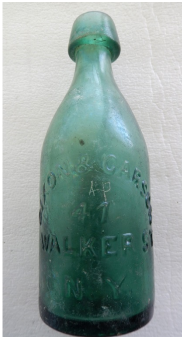
Artifact Numbers DcRu 123:22