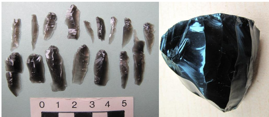
Left: Razor sharp Obsidian microblades. Right: Microblade core of Obsidian. The long flutes show where the sharp blades came from.

The evidence for microblade technology is found in the form of tiny thin blades and the small wedge or conical shaped cores from which they were removed.