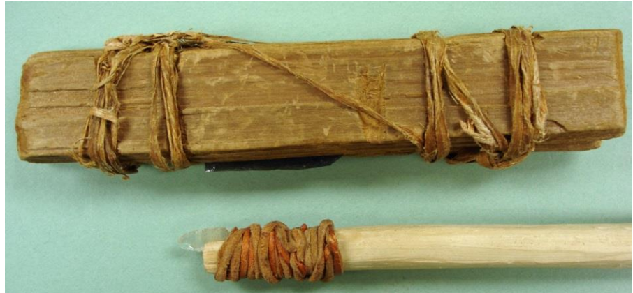
Above: Examples of how microblades were put in handles. Below: Microblade cores of Quartz Crystal (left) and Dacite (right).

Pressure flaking was an efficient and sustainable use of limited raw materials and because of their small size they were easy to trade over long distances.