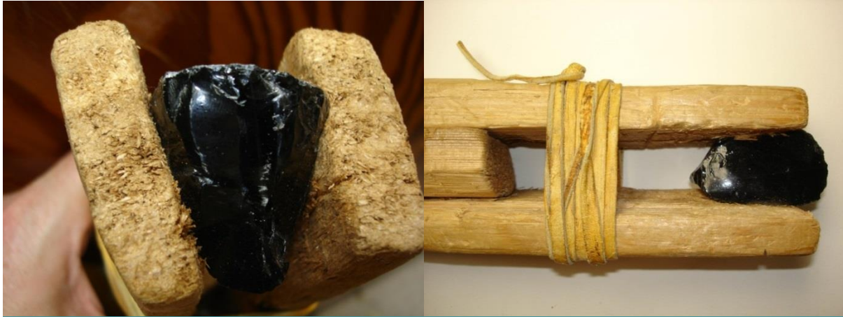
The prepared core of fine stone is placed tightly in a wooden vice to hold it in place when flakes are being removed.

The point of an antler pressure flaking tool is then placed on the edge of the platform where it intersects with a slight ridge. A quick steady pressure is applied until a tiny blade snaps off the core.