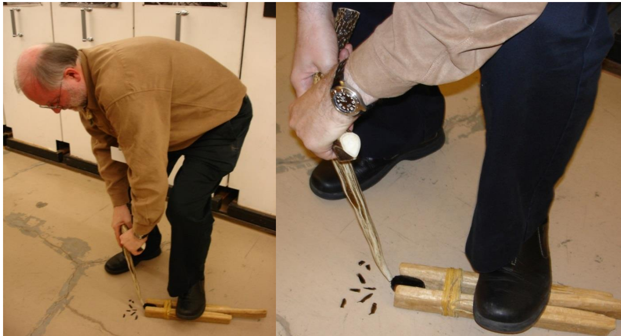
Removing microblades by pressure flaking.

The point of an antler pressure flaking tool is then placed on the edge of the platform where it intersects with a slight ridge. A quick steady pressure is applied until a tiny blade snaps off the core.